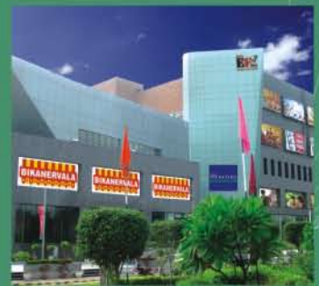
EF3 Mall NH-2, Faridabad