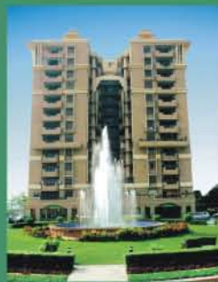
Royale Retreat Charmwood Village, SurajKund Road, Faridabad