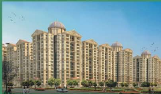
Eros Sampoonam Greater Noida