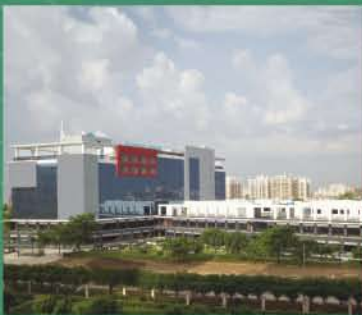
Eros City Square Rosewood City, Sector 49-50, Gurgaon