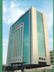
Eros Corporate Tower Nehru Place, New Delhi