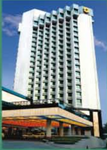
Shangri-La's Eros Hotel Ashoka Road, New Delhi