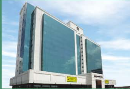
Eros Corporate Park IMT Manesar, Gurgaon